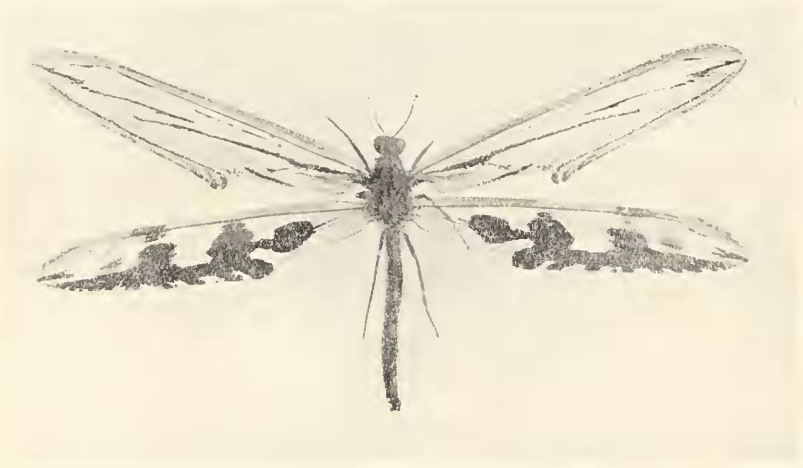
FIG. 4.—PALPARES ONEILLI.

wings, the emargination although very conspicuous is not lobate at the end; both are hyaline with fuscous markings, the sub-costal and radial nervures are flavescent, and the pterostigma is very indistinct; in the fore-wings the costal interval is sprinkled with black and white seriate patches along the margin from about half the length to the apex, and the hind margin is tessellated in the same fashion from the apex to the post-median lobe, but the macules are large and very distinct; in the centre of the disk there extends a narrow black band on both sides of the cubital vein from the base to past the median part, and parallel to this narrow band, but situated above it,